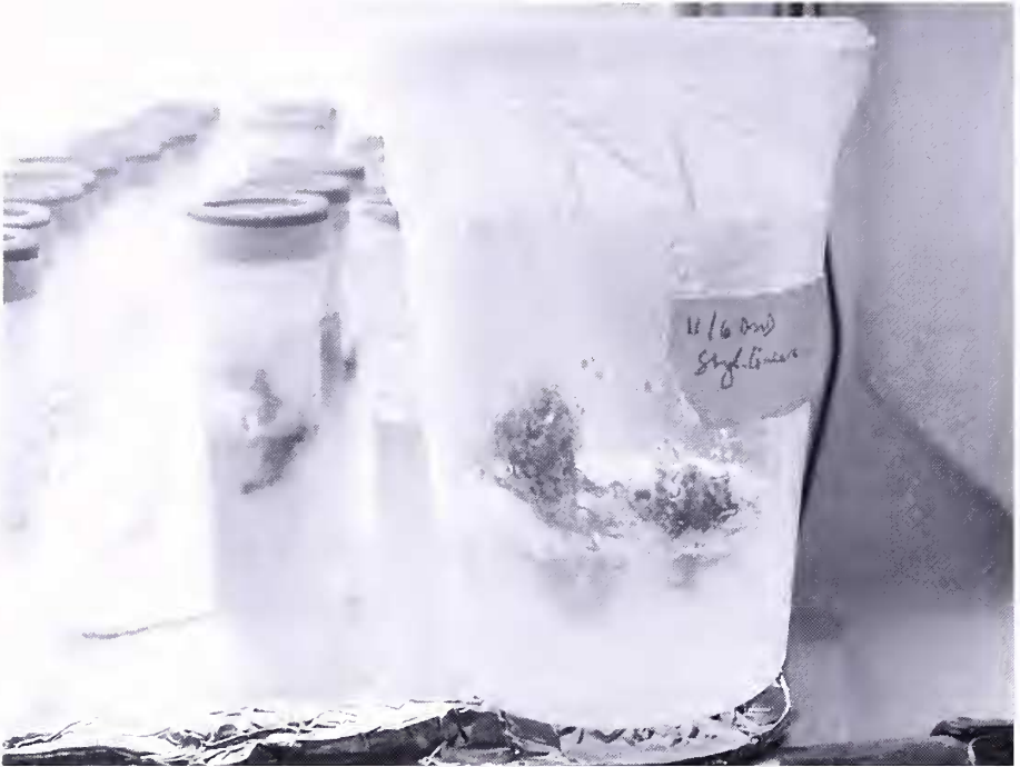
Figure 1: A tissue culture ( Styliidium lineare ) in a urine specimen container, in front of tissue cultures growing in smaller, 50 ml centrifuge tubes.